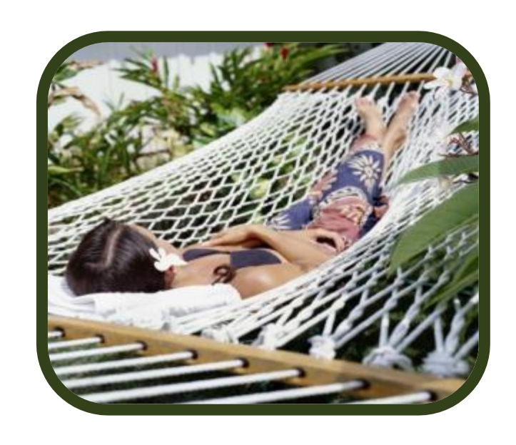
Built FOR me