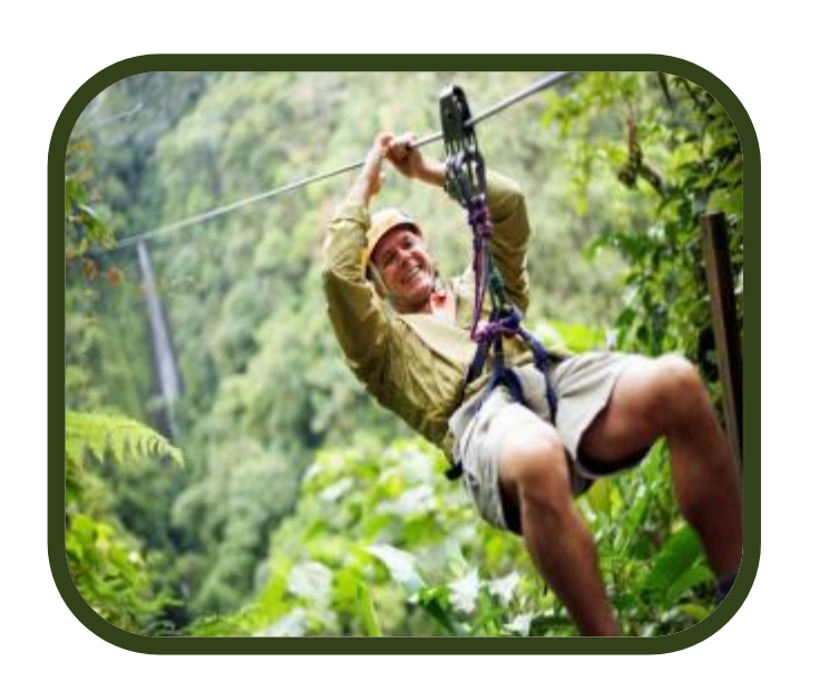
Built BY me